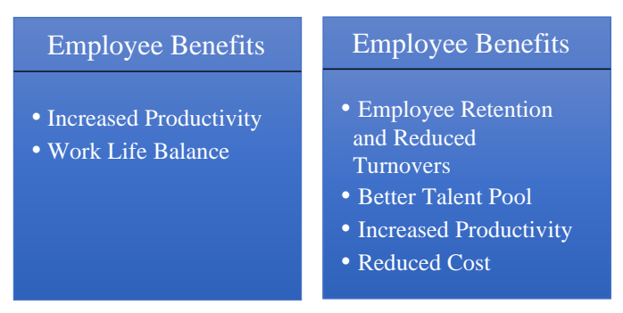
Fig. 3 Impacts of flexibility workplace

A flexible Workplace has proven to provide employees with a better work-life balance. Many organizations are adopting one of three work arrangements – Remote – allowing workers to work remotely 100% of the time, Hybrid – Allowing employees to work a part of their schedule from the office and working for the most part from the office. Having this flexibility helps the employee to balance their work and personal life accordingly.